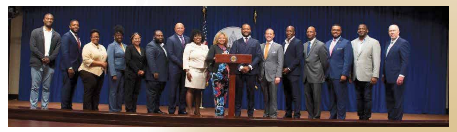
PLBC members threw their support behind a new statewide business association for Black-owned businesses.